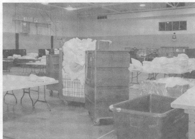
Gym where clean laundry is assembled for delivery