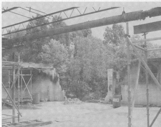
Same wall from inside