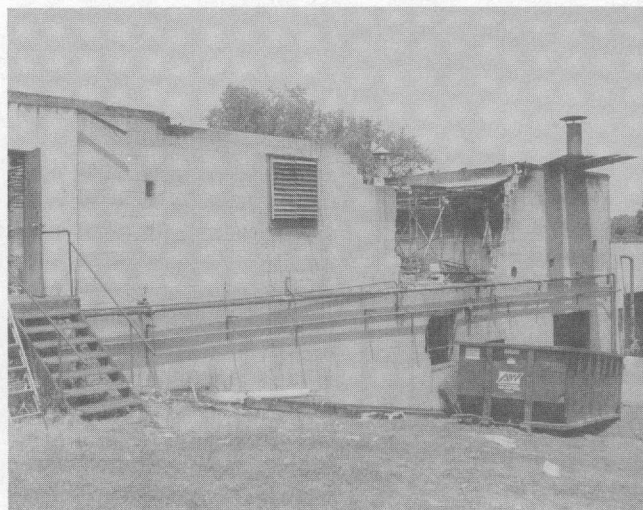
East outside wall in area where fire started