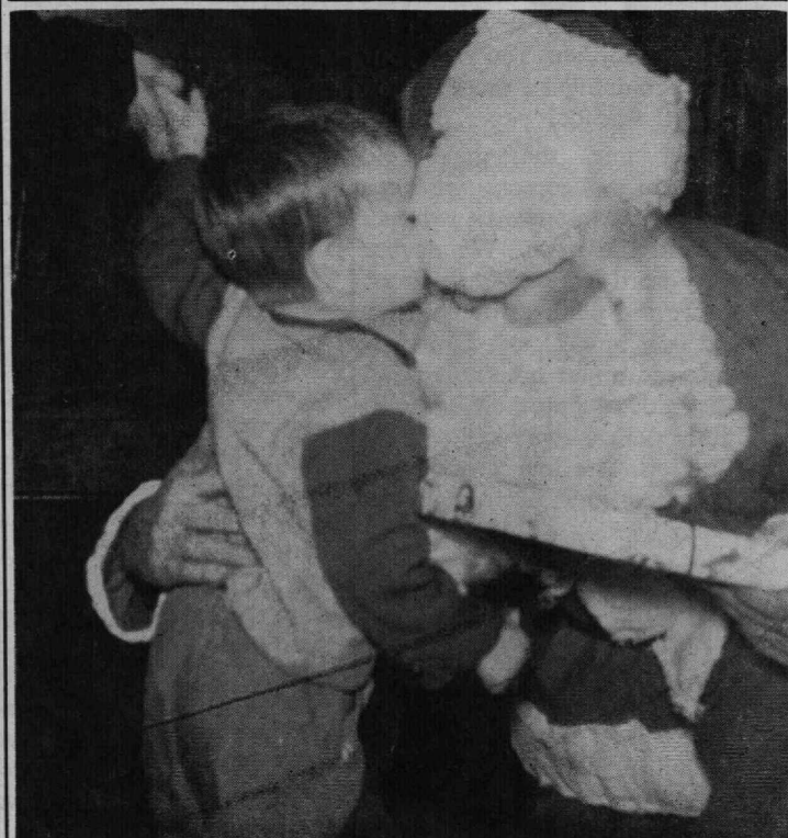
At the ASMC Christmas Party for Children

The ASMC purchased the toys and the clothing, and Kroger's and Hill's donated the Christmas treats for the stockings.